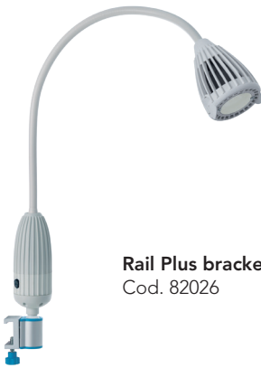
Rail Plus bracket Cod. 82026