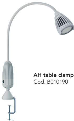
AH table clamp Cod. B010190