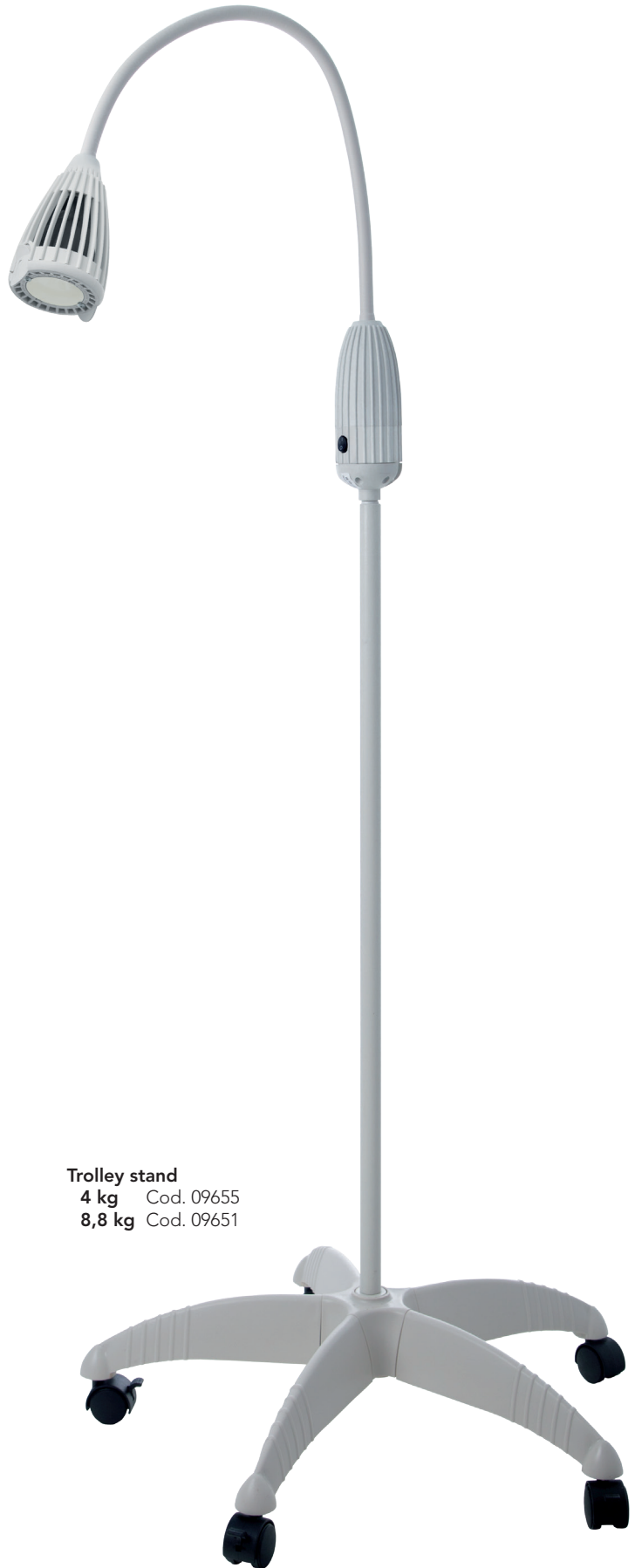
Trolley stand 4 kg Cod. 09655 8,8 kg Cod. 09651