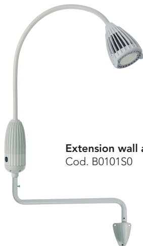
Extension wall arm Cod. B0101S0