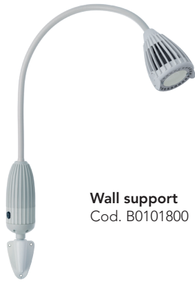
Wall support Cod. B0101800