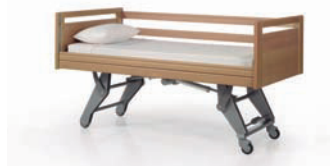
Maximum height: 77 cm.