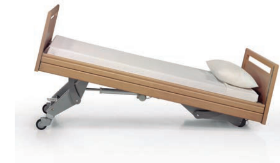
Reverse trendelenburg \pm 16^\circ

Reduces physical effort needed to move patients.