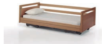
Minimum height: 20,5 cm.