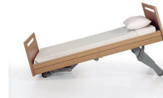
Trendelenburg \pm 16^\circ

Our high quality products, reduce time for cleaning up to 30%. Smooth surfaces and detachable panels allow a quick and easy cleaning and disinfection.