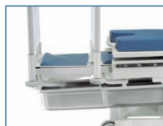
○ Bed extension: integrated mechanical system to extend the bed up to 20 cm.