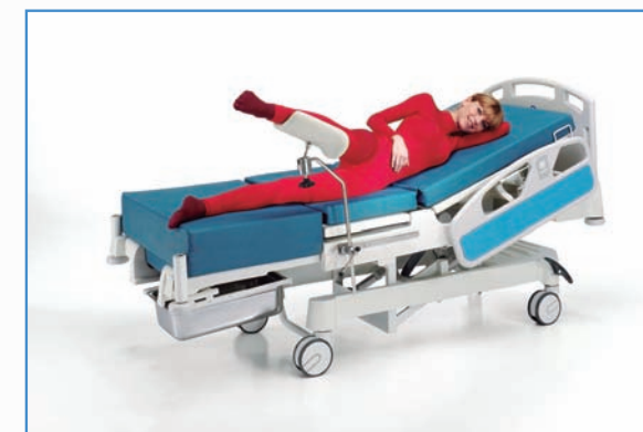
○ Retrosopic examination position