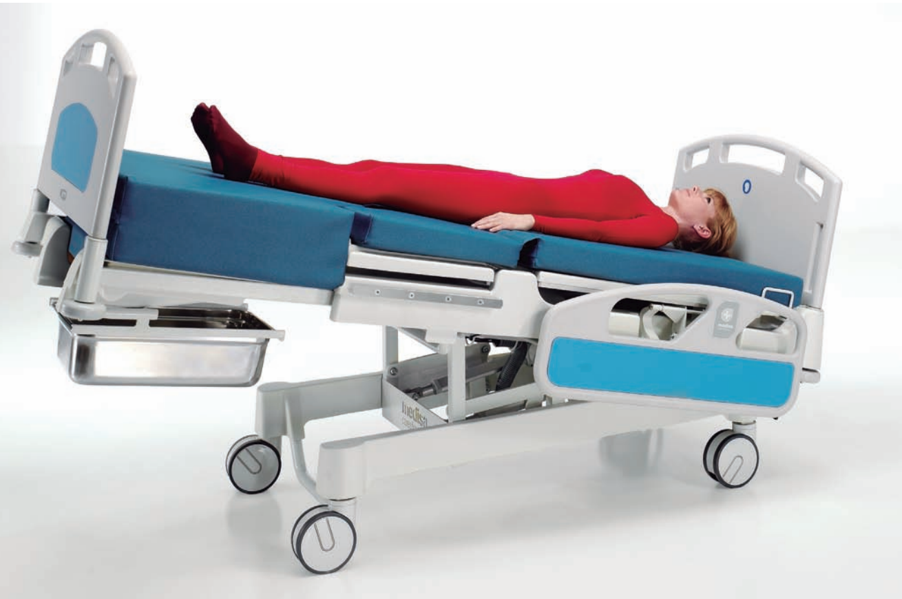
o Trendelenburg Position - 16°