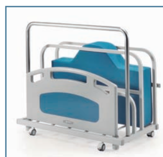
○ Accessories trolley (Optional) Ref. MB-OPTIMA-02