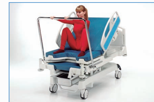
○ Squatting position, with rail