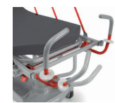
Push handles ease to fold