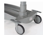
20 cm diameter wheels

Easy and safe to use, reducing the risk of bruising or trapping. Solid and hygienic structure. Their lowest position does not exceed the height of the mattress, making transfers simpler and safer.