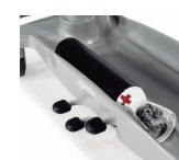
Integrated oxygen bottle holder

Our products are made of high quality materials, guaranteeing their long life and endurance. Their flat and smooth surfaces make them easy to clean and quick to disinfect.