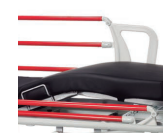
New folding siderails

Excellent value for money. Easy and quick handling. Wide range of accessories. 100% radiolucent frame. Lightweight.