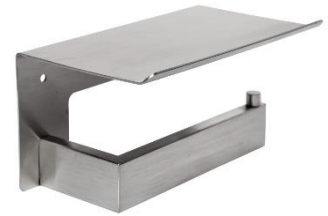
AI2005CS Satin finish