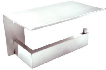
AI2005C Bright finish