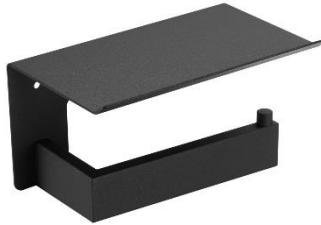
AI2005B Black finish