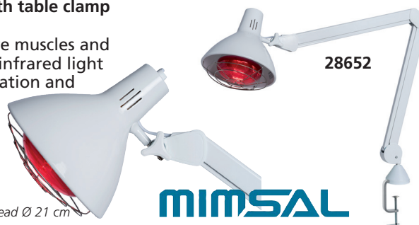
Head Ø 21 cm