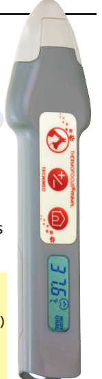
Sold in blister