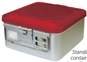
Standard containers (supplied with 1 paper filter)