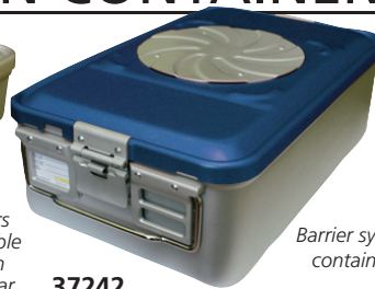
Barrier system containers