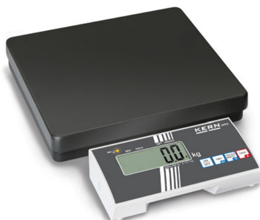
KERN MPB with free-standing