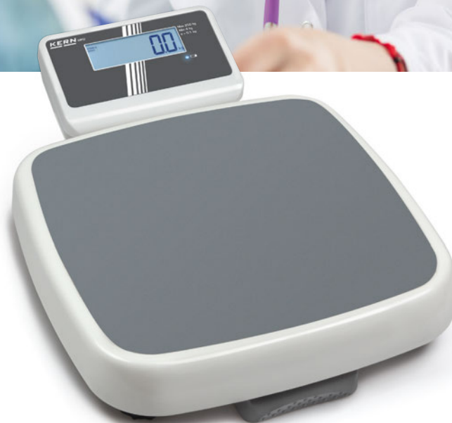
KERN MPD 250K100M