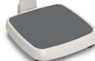
KERN MPE-P with stand