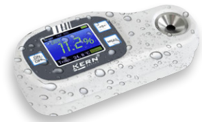
IP65: Protected against dust and water splashes