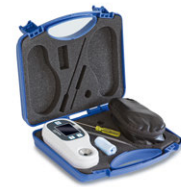
Transport and storage case