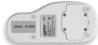
Rear view, screw-on battery compartment cover