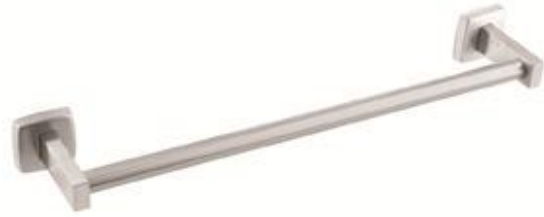
AI0184CS Satin finish