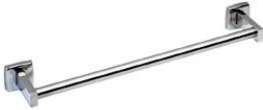
AI0184C Bright finish