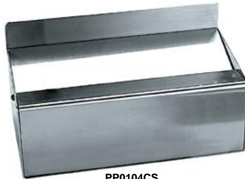
PP0104CS Satin finish