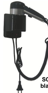
SC0020CS black finish