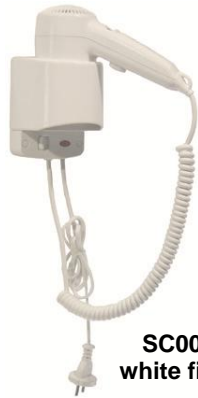
SC0020 white finish