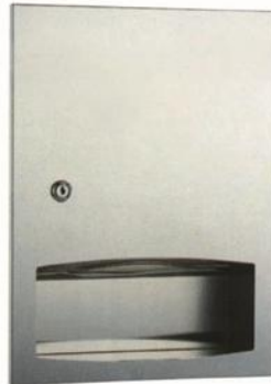
DTE0020CS Satin finish