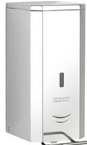
DJP0034C Bright finish