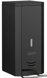
DJP0034B Matte black epoxy finish