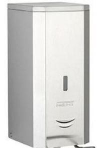
DJP0034CS Satin finish