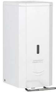
DJP0034 White epoxy finish