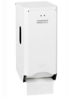
PR2784 White epoxy finish