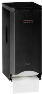
PR2784B Black epoxy finish