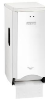
PR2784C Bright finish