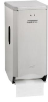
PR2784CS Satin finish