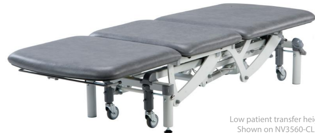
Low patient transfer height Shown on NV3560-CLS Colour Light Grey