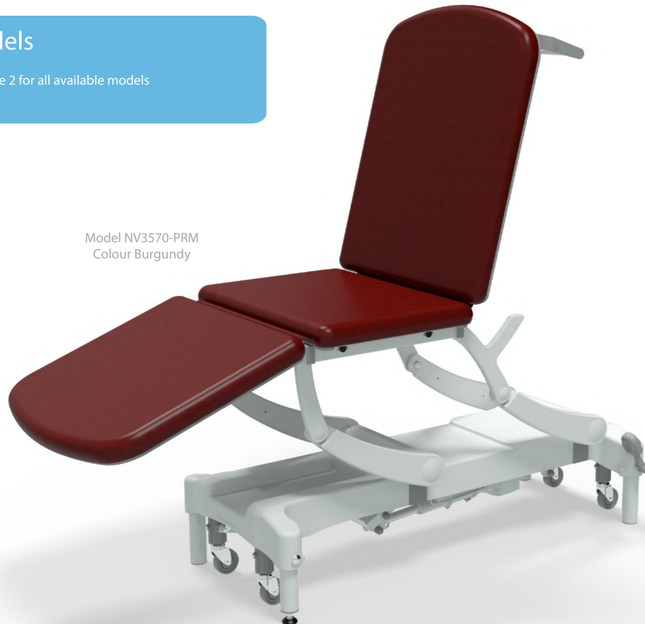
Model NV3570-PRM Colour Burgundy