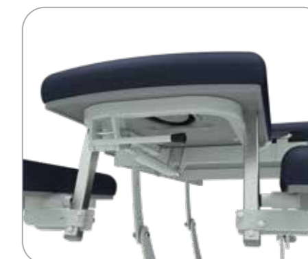
Offset gas strut for unobstructed patient view