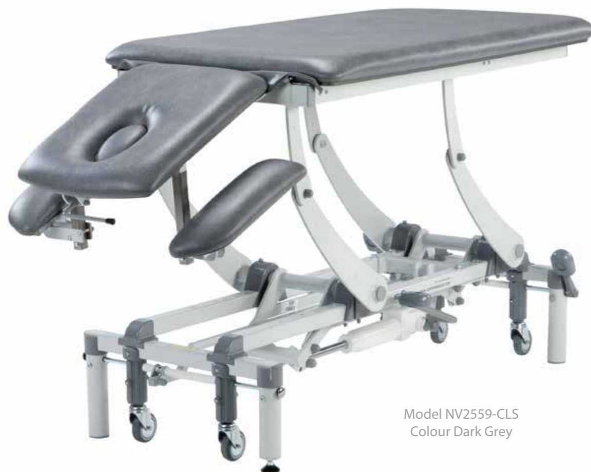
Model NV2559-CLS Colour Dark Grey