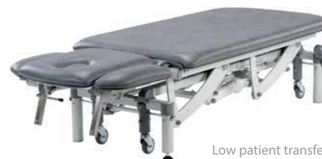
Low patient transfer height