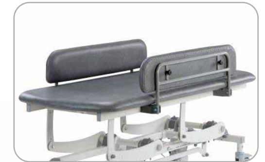
Optional 6002P Cushions for Side Support Rails