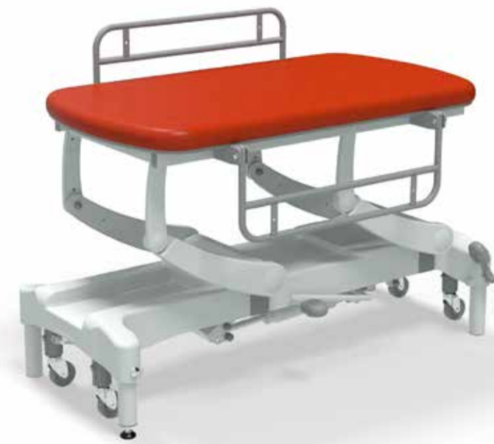
Model ST1561C-PRM (Small) Colour Poterie