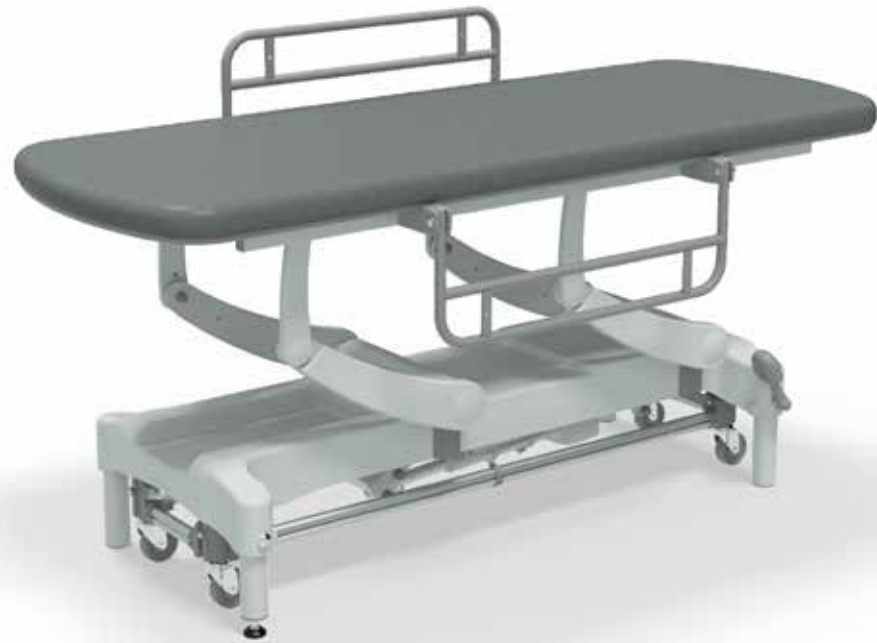
Model ST1561A-PRM-EPFS (Large) Colour Light Grey