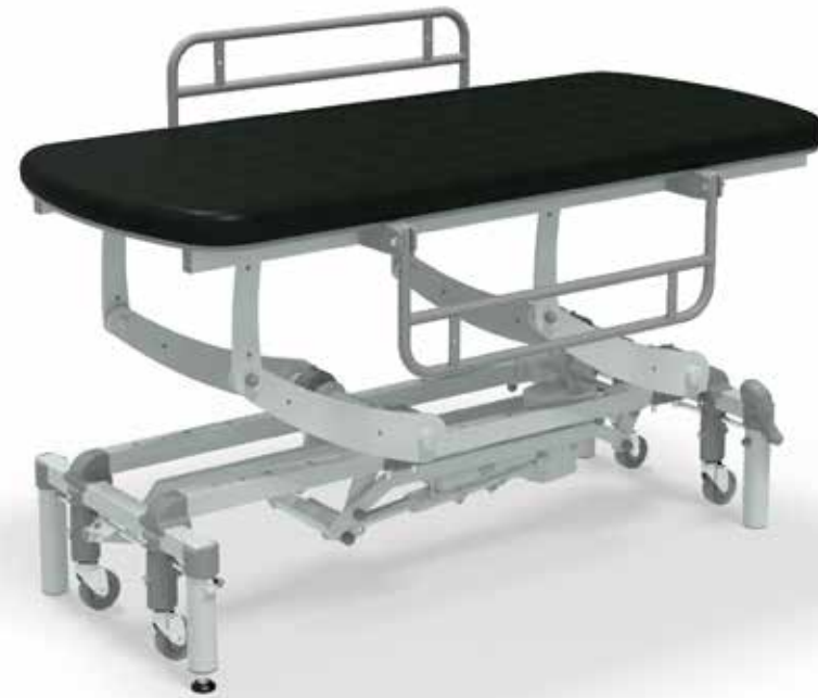
Model ST1561B-CLS (Medium) Colour Black