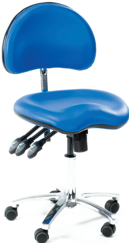
Model MC7212 Standard contoured medical chair