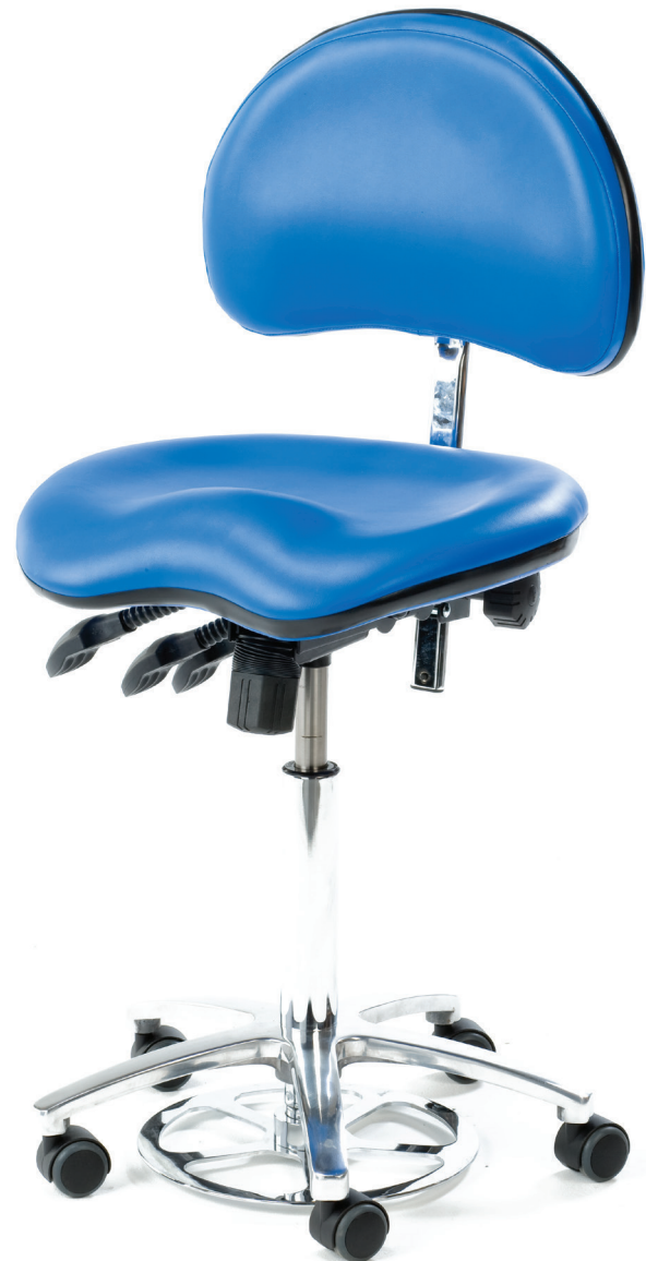
Model MC7213 High model contoured medical chair with optional foot height control