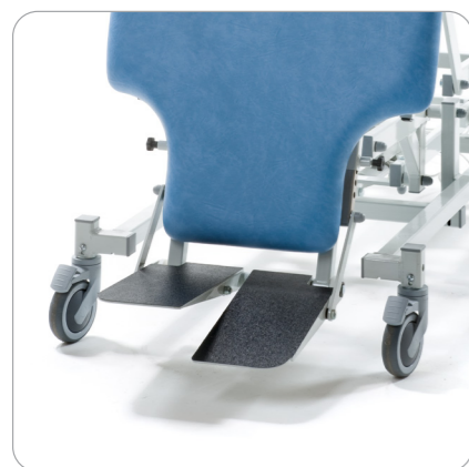
Individually adjustable dual foot boards