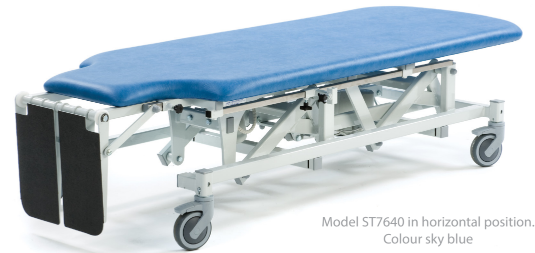
Model ST7640 in horizontal position. Colour sky blue