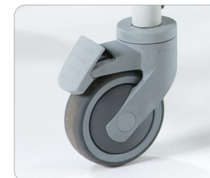
Individually braked castors. Models ST7640 & ST7640DL