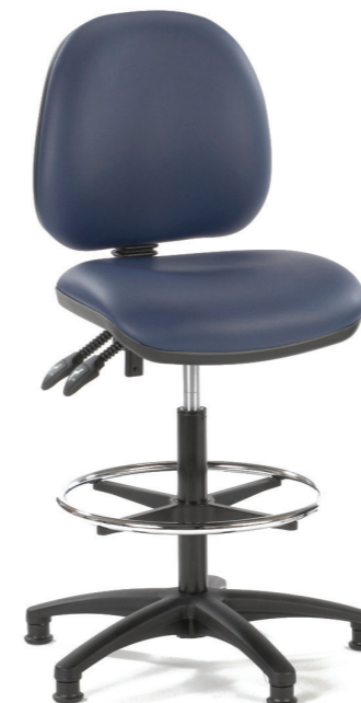
Model 6101 optional matching high operators chair