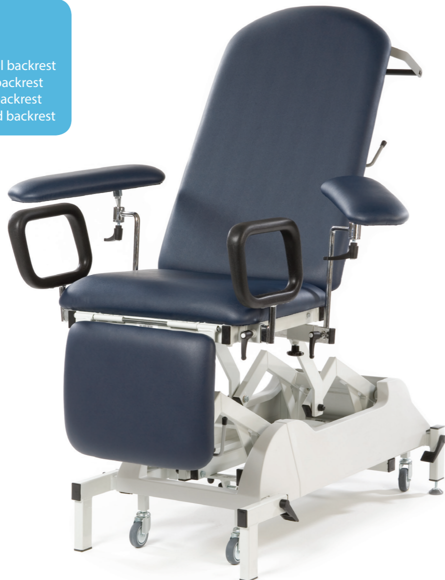
Model SM9566P with optional base cover. Colour dark blue