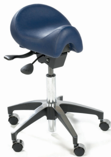
Model 6107 optional matching deluxe saddle chair

See page 48-49 for additional information on our range of optional accessories.