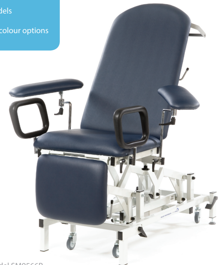
Model SM9566P Colour dark blue