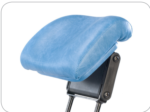
Fully adjustable headrest