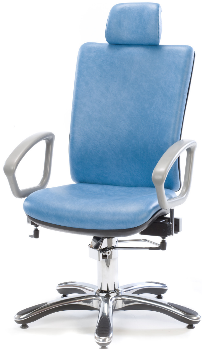
Model MC6172 in Sky Blue