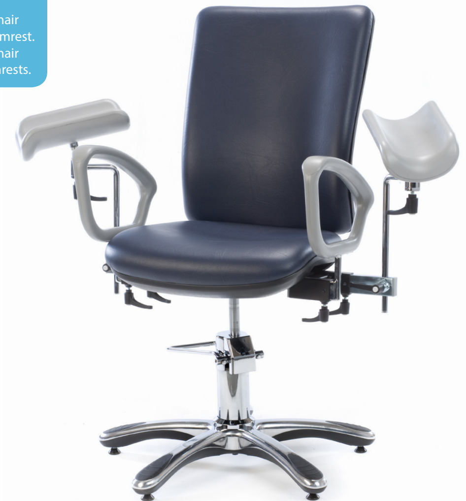
Model MC6155 in Dark Blue