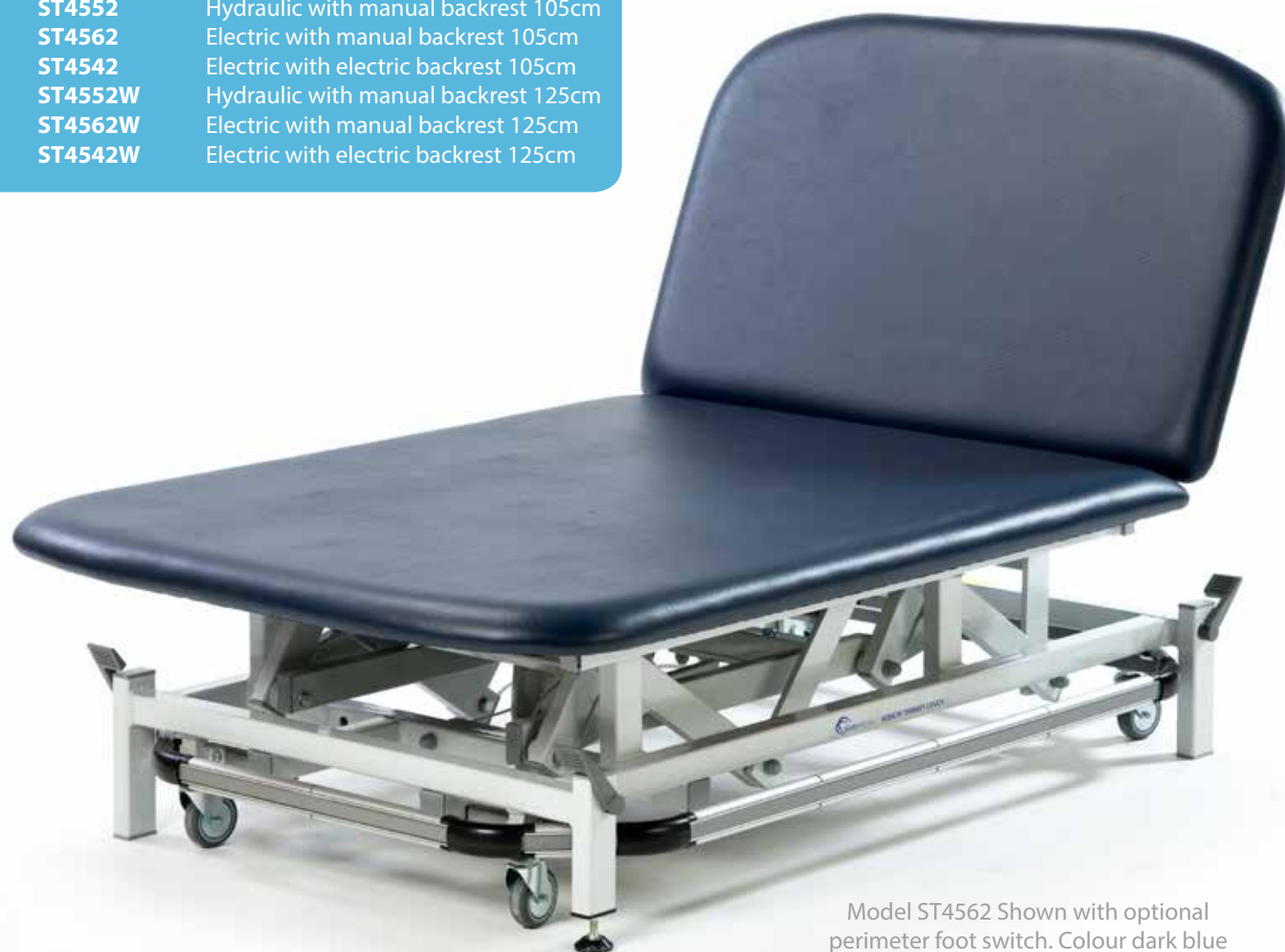
Model ST4562 Shown with optional perimeter foot switch. Colour dark blue