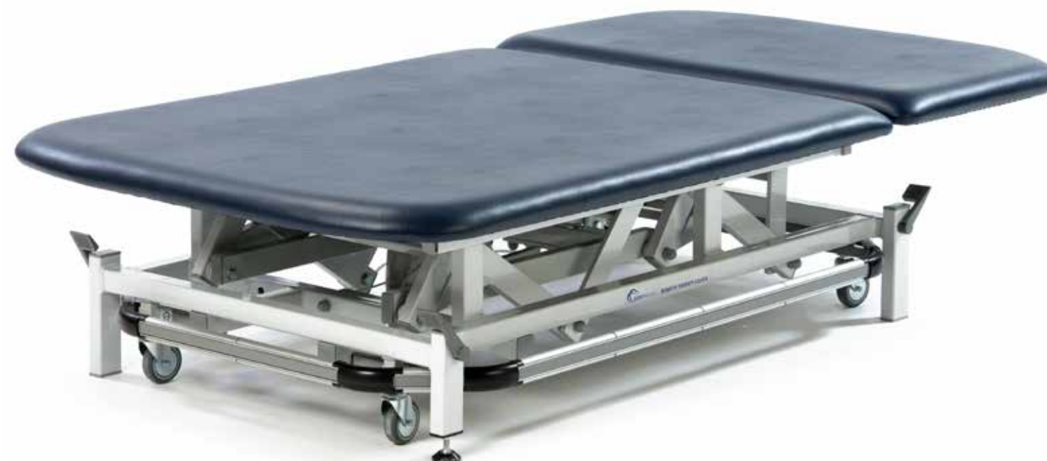
Model ST4562 Shown with optional perimeter foot switch in low patient transfer height.

See page 48-55 for additional information on our range of optional accessories and colour options