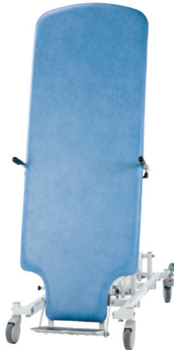
Model ST7645 Colour Sky Blue