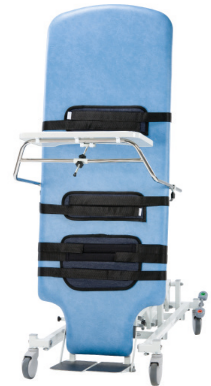
Set of harnesses & worktable included as standard