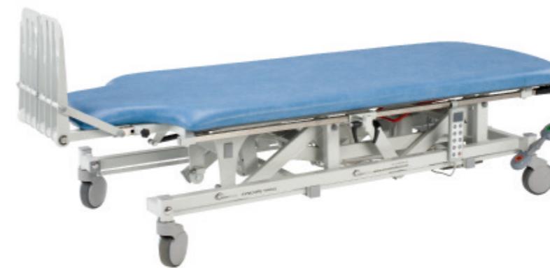
Lowered to minimum height for patient transfer